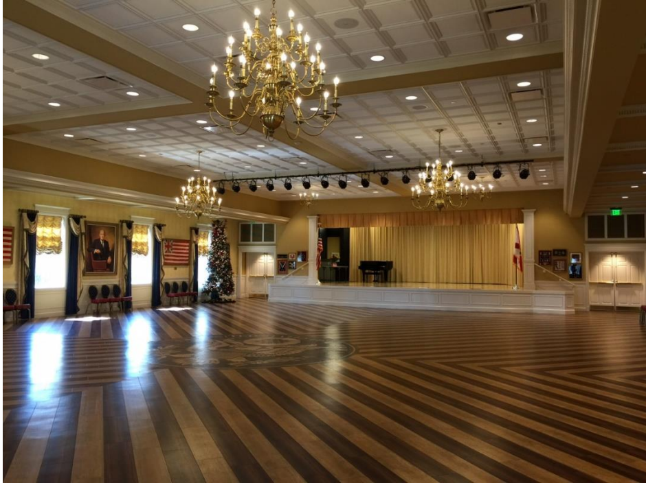
General Bradley ballroom - one of the two large rooms that will be hosting our Expo '17 at the Eisenhower Center